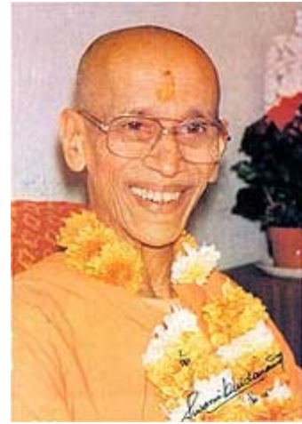
Sri Swami Chidananda

SERVE, LOVE, GIVE, PURIFY, MEDITATE, REALIZE So Says Sri Swami Sivananda