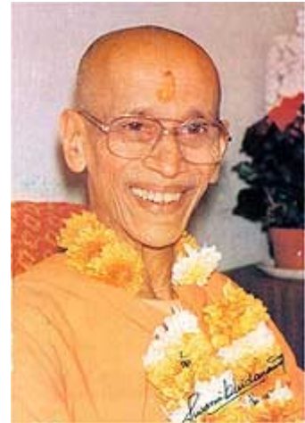
Sri Swami Chidananda

SERVE, LOVE, GIVE, PURIFY, MEDITATE, REALIZE So Says Sri Swami Sivananda