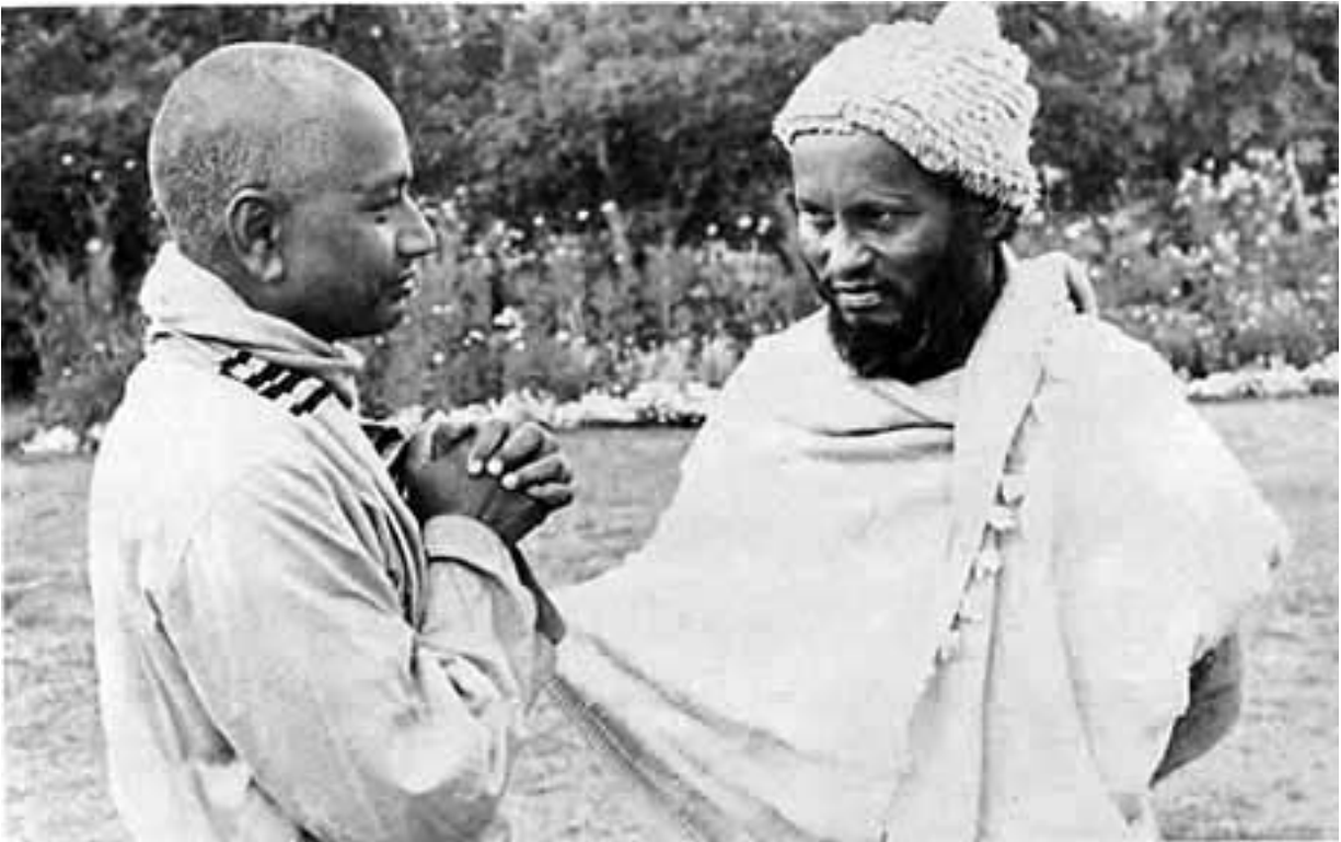
Swami Muktananda Paramahansa