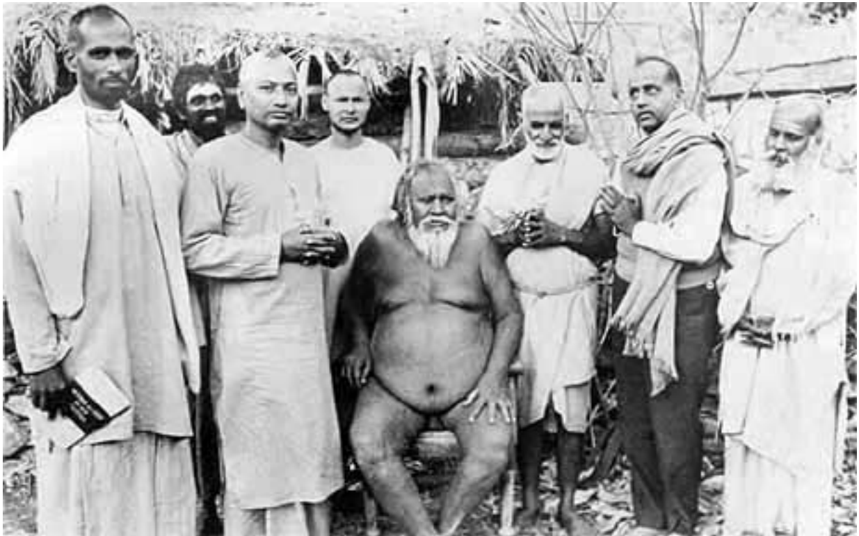
A Holy Avadhuta (naked ascetic) of the Himalayas