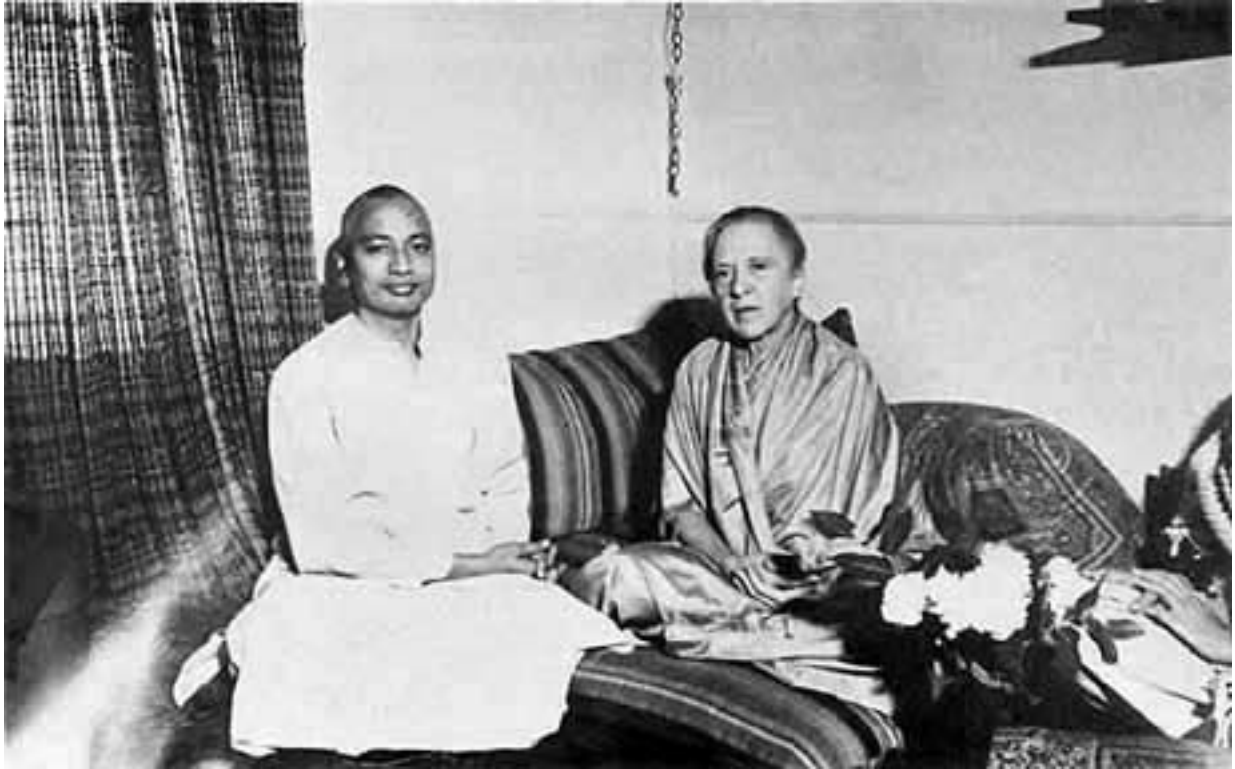
Yogini Indira Devi of California