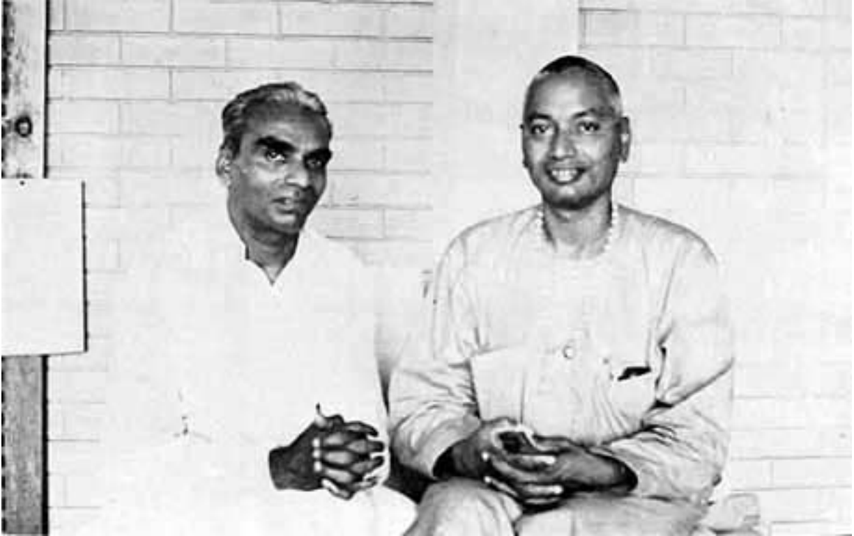
Yogi B.K.S. Iyengar