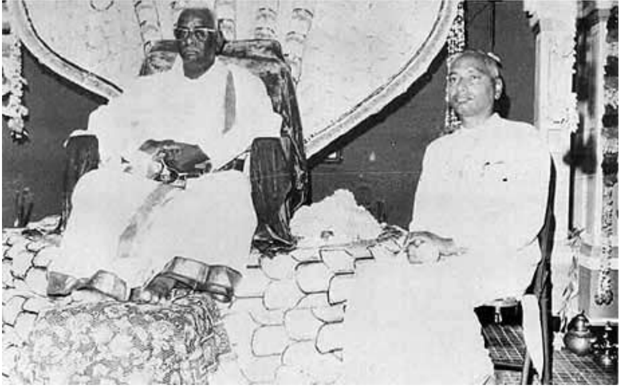
Sri-Ia-Sri Pandrimalai Swamigal