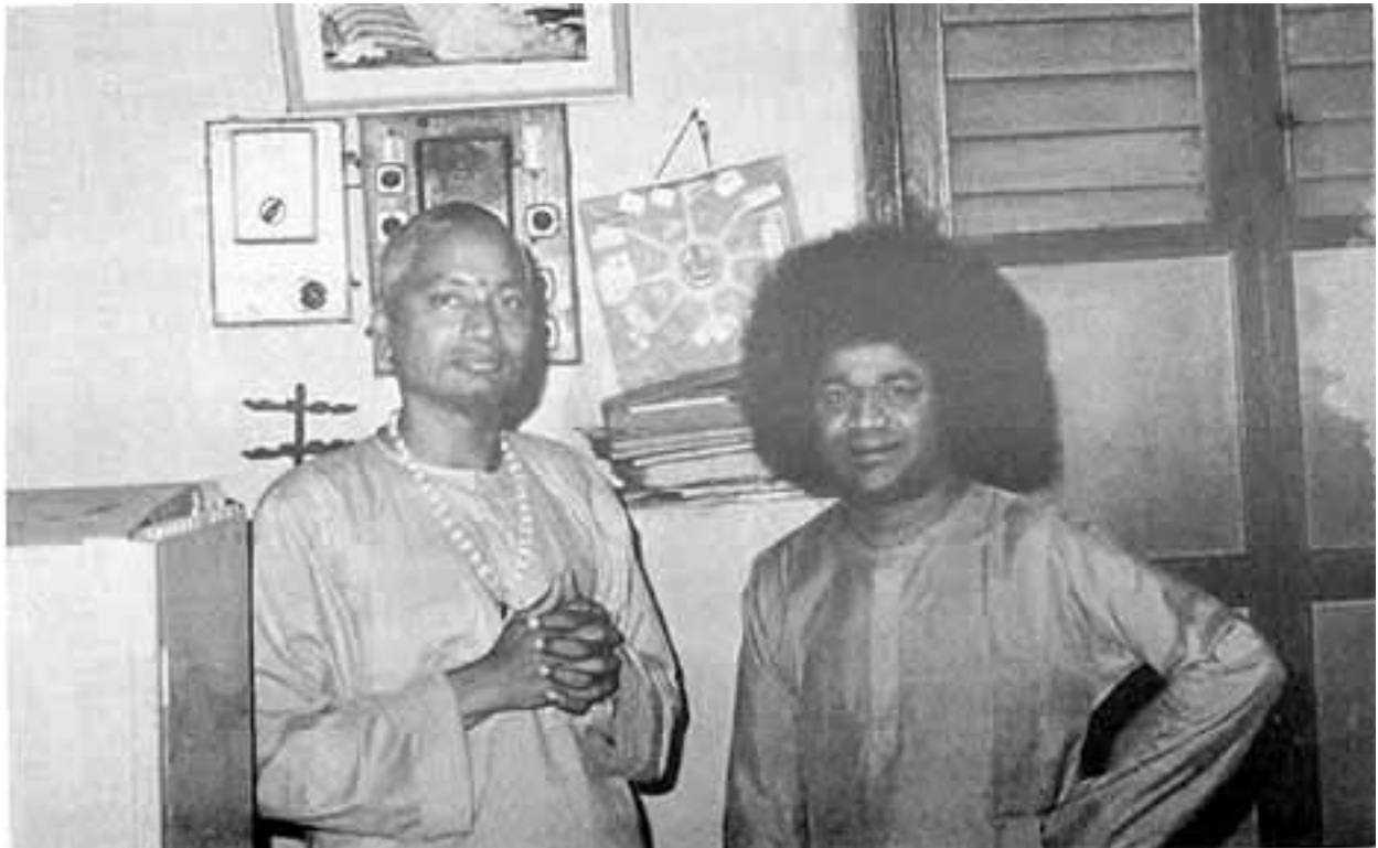
Bhagavan Satya Sai Baba