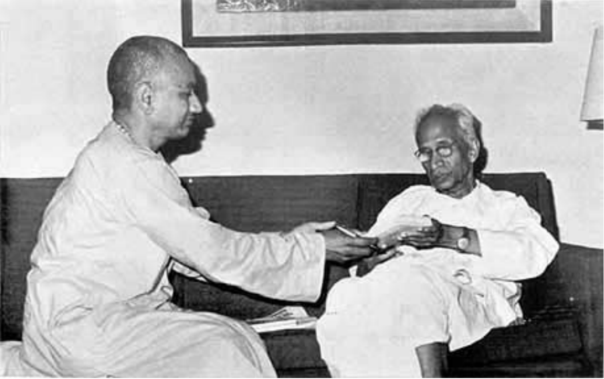
Dr. S. Radhakrishnan, ex-President of India