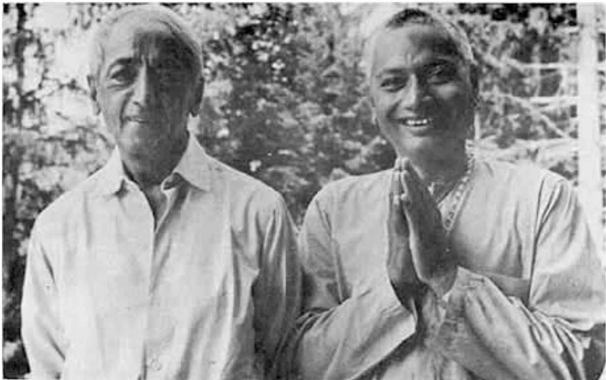
Mr. J. Krishnamurti—Gstaad, July 1969