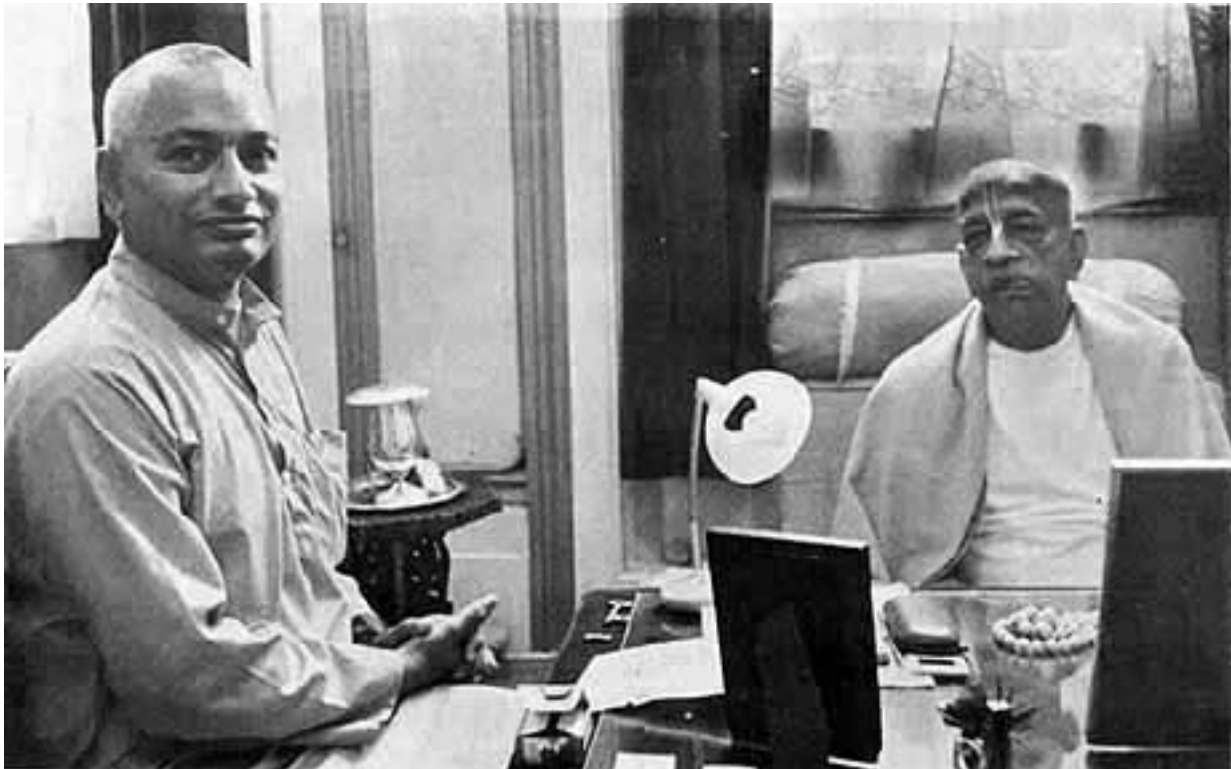
Sri-la-Sri Bhaktivedanta Swami (Head of the Krishna Consciousness Movement)