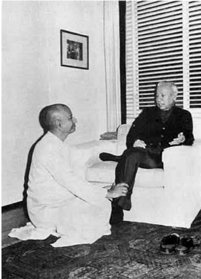
Swami Prabhavananda of California