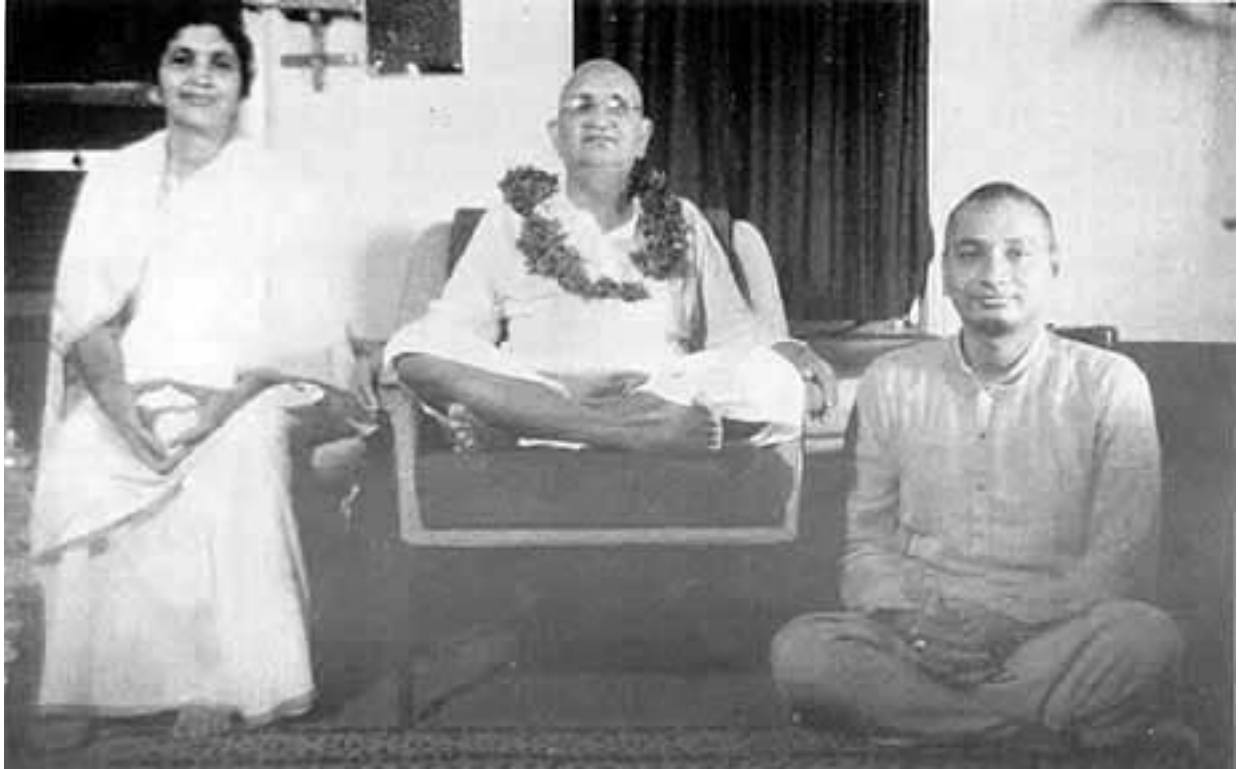
Swami Ramdas and Mother Krishna Bai