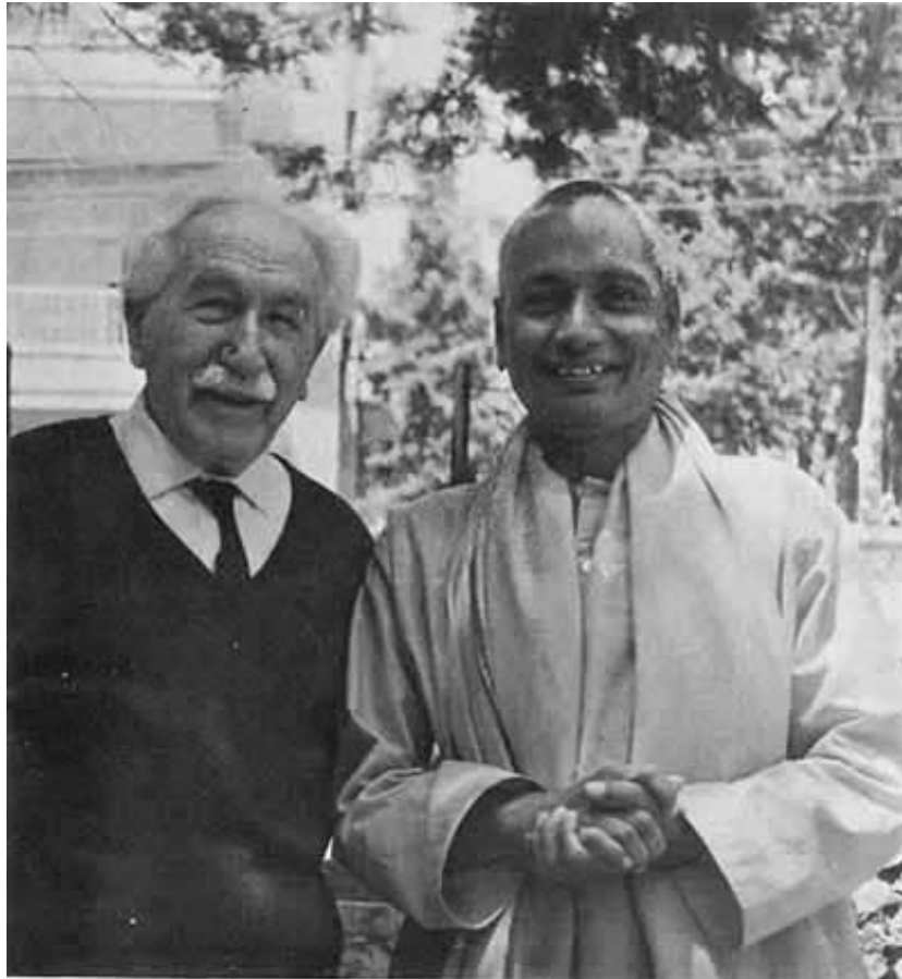
Dr. Hugo Bergman of Jerusalem