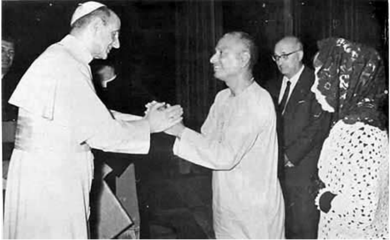
H.H. Pope Paul VI