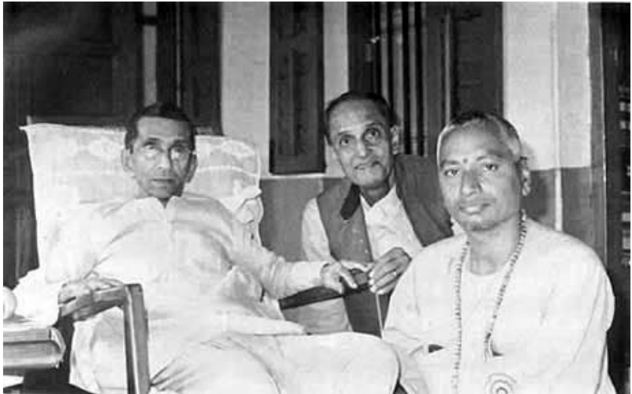
Swami Vireswarananda, President of the Ramakrishna Mission