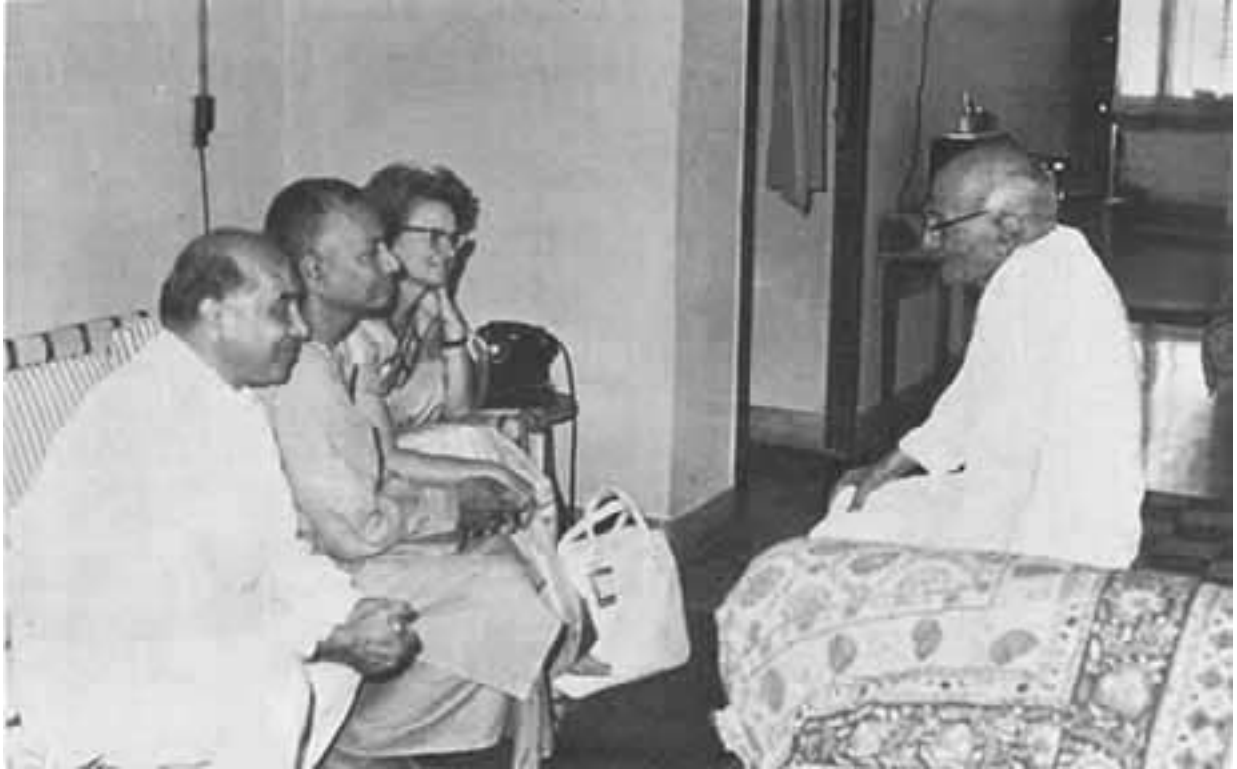
Mr. C. Rajagopalachari, ex-Governor-General of India