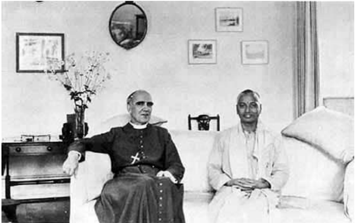
Archbishop Selby-Taylor of Cape Town