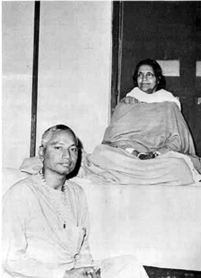
Sri Ananda-mayi Ma