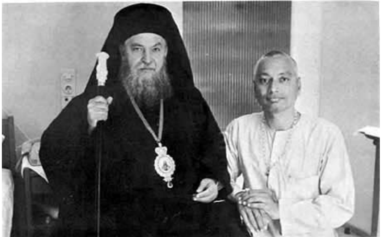
Archbishop Gregorios of the Greek Orthodox Church