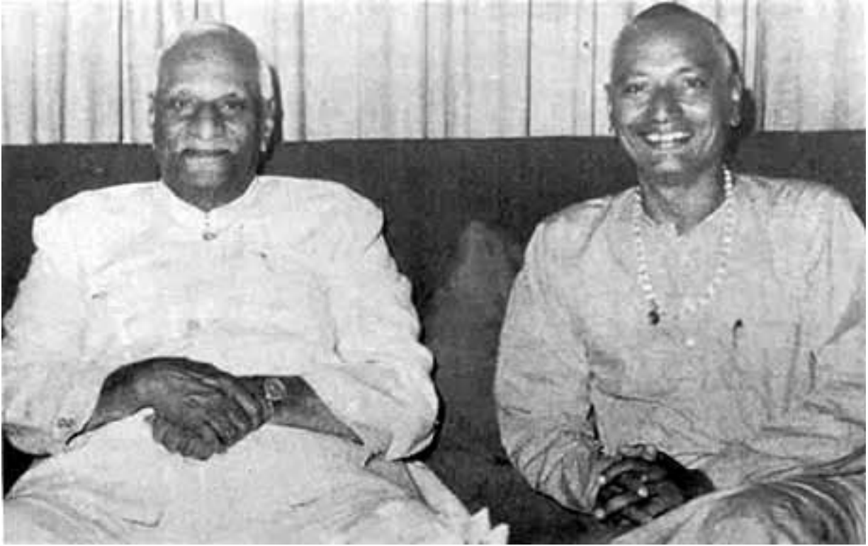
Mr. V.V. Giri, President of India