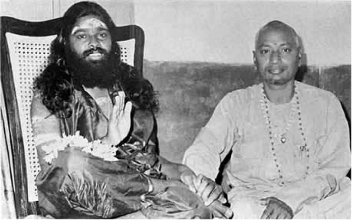
Swami Satchidananda of Mysore