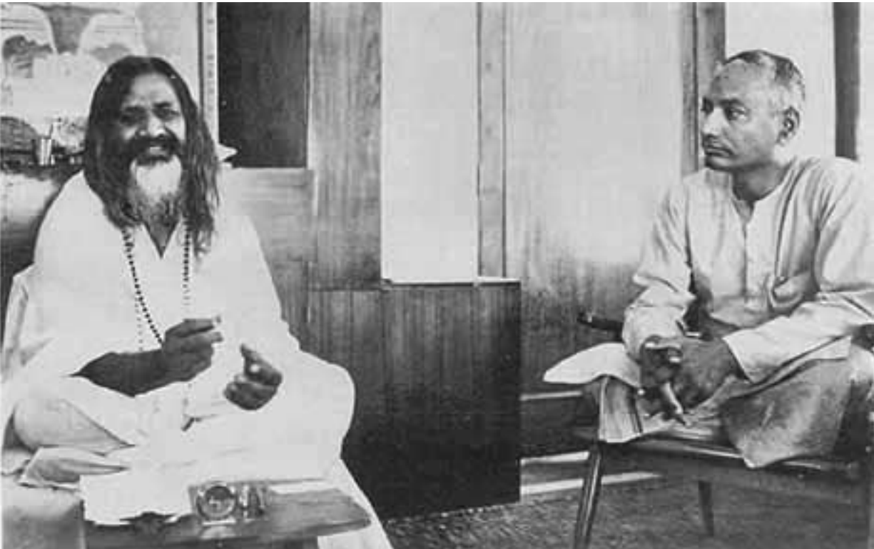
Maharshi Mahesh Yogi