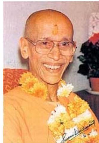
Sri Swami Chidananda

SERVE, LOVE, GIVE, PURIFY, MEDITATE, REALIZE So Says Sri Swami Sivananda